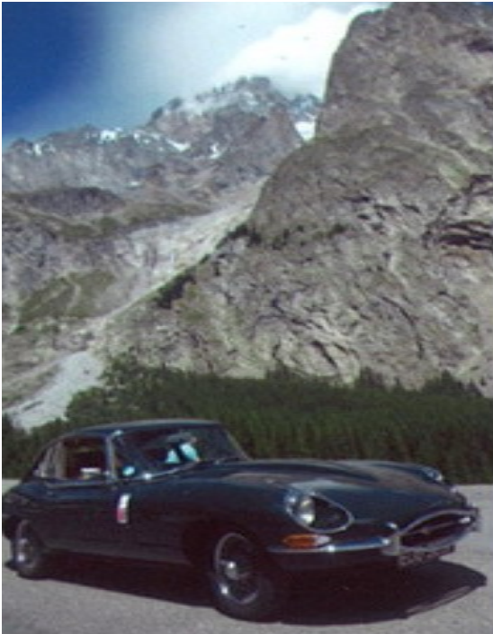
The 2+2 at Mont Blanc

M y wife is a retired French teacher and a lot more cultured than her “car guy” husband. She would rather spend time in museums and art galleries than sit at a car show and as she says, listen to guys talk about car parts. A number of years ago, 2011, the Jaguar XKE celebrated its 50 th anniversary. It was introduced to the press in Geneva in 1961. A 2 week tour was being organized to replicate the dash rom Coventry to Geneva. Since most of that trek took you across France, I wanted to surprise my wife with this tour. The only hitch was how to get an E Type for this event. I didn't want to ship my car via container to Europe, not only because of the cost but also concerns of caring for it on this 2 way transatlantic