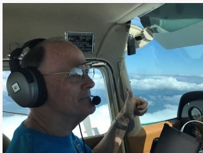
Ultimate social distancing at 3000 feet!!