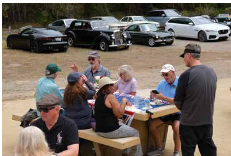
We can hardly wait to do it again.