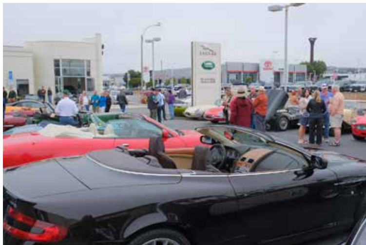
More Cars and Coffee Fun.