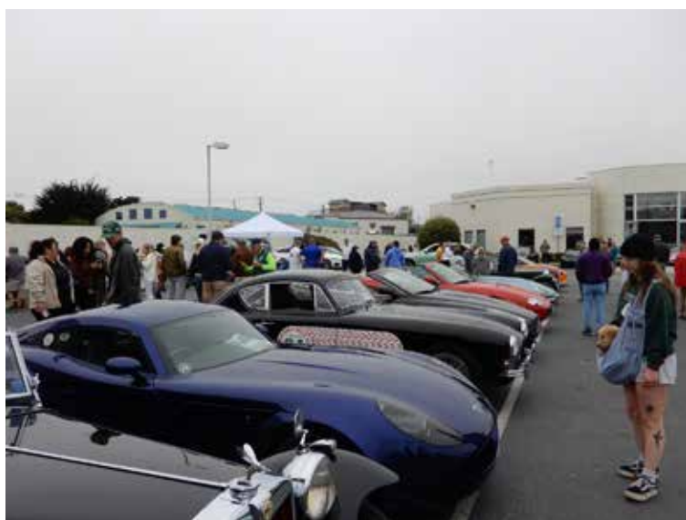
This Editor's kind of Cars and Coffee.