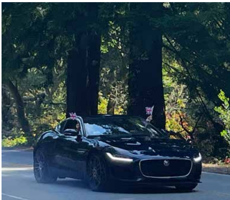
Blue trading the heat of Fresno for the trees of Pebble Beach.