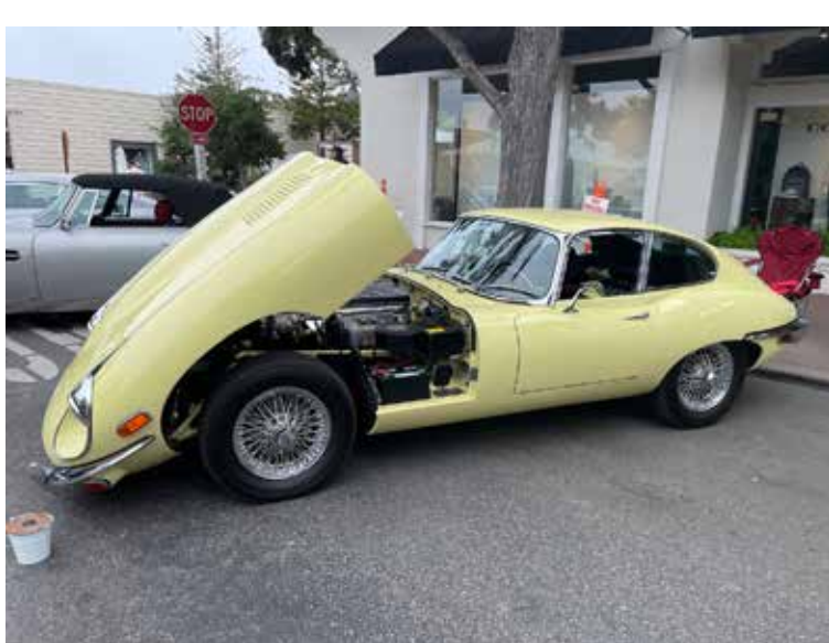
The Prestons Primrose E-Type at Concours for a Cause.