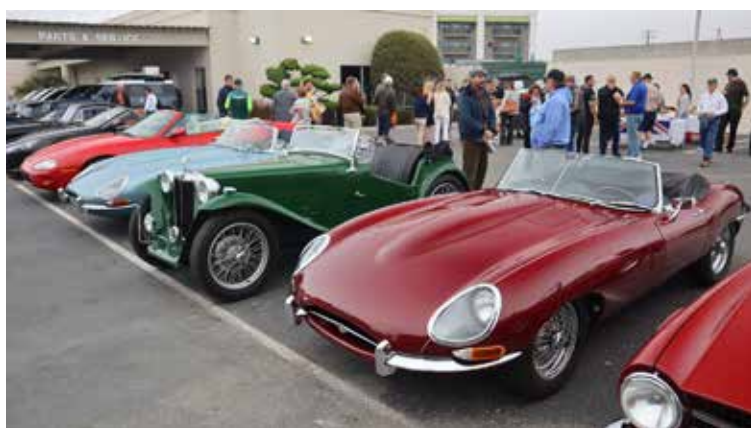
Varied collection of British cars gathered at Jaguar Monterey for Cars & Coffee event.