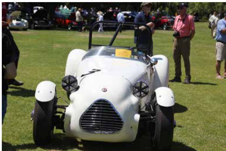
The 1950 Parkinson Jaguar Special won the Best Race Car Category.