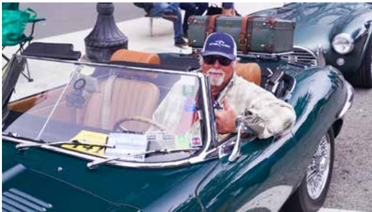
Gassed up and ready to rally at the Pacific Grove Auto Rally.