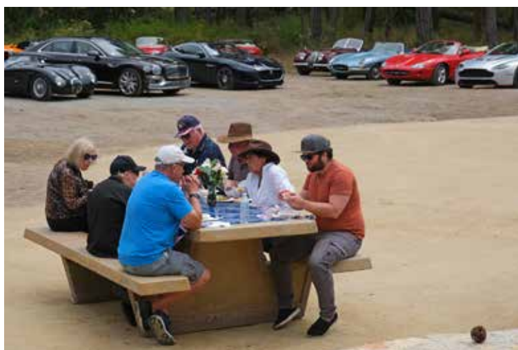
That's what I call lunch with a view.