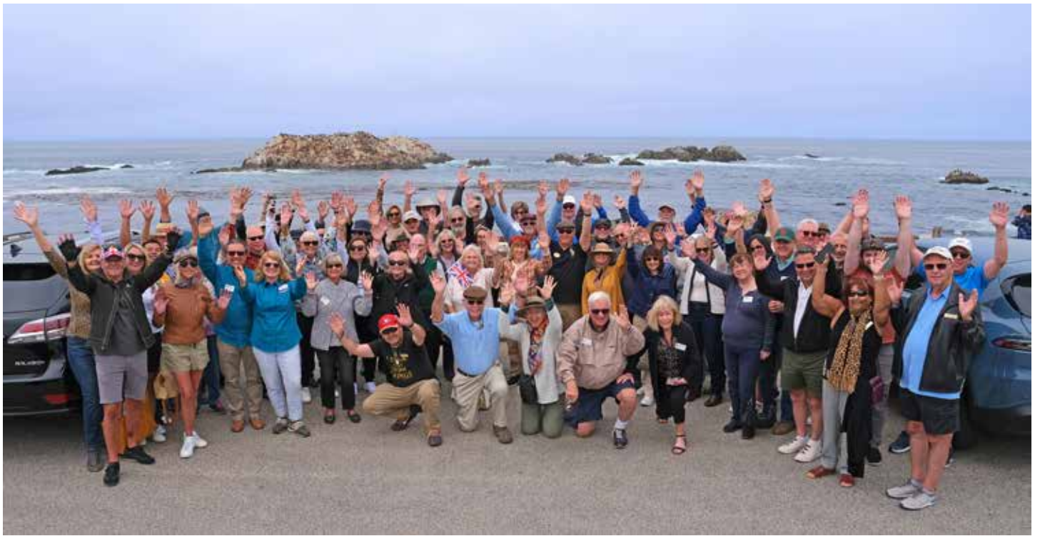
2025 Pebble Beach British.